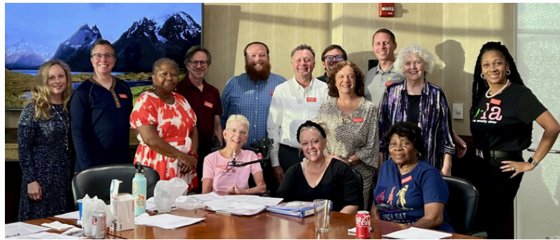
Citizen Advocacy Board & Staff September 2024

BECOME A SUSTAINING SUPPORTER! MONTHLY GIVING CAN BE LESS THAN A LATTE, AND MAKE A REAL IMPACT